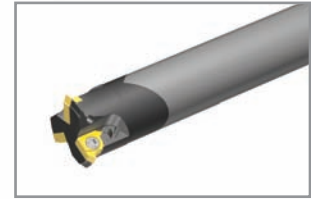
Carbide Cylindrical Shank Cutting Dia - .51-.70 No. of Flutes - 1-3

Buy 6 inserts and receive 1 Weldon Shank Holder FREE