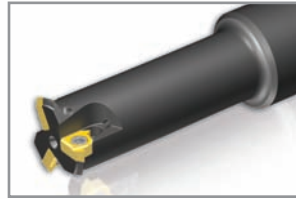
Weldon Shank Cutting Dia - .51-.70 No. of Flutes - 1-3