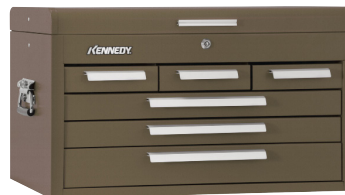
266 6 Drawer Chest