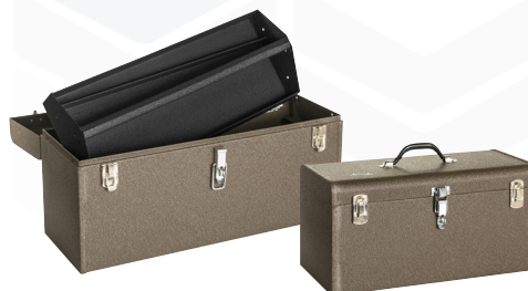
K20 Professional Tool Box