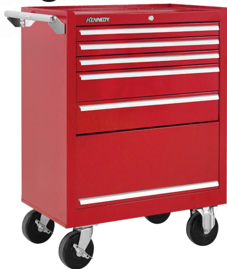
295X 5 Drawer Cabinet 29" W x 20" D x 35" H