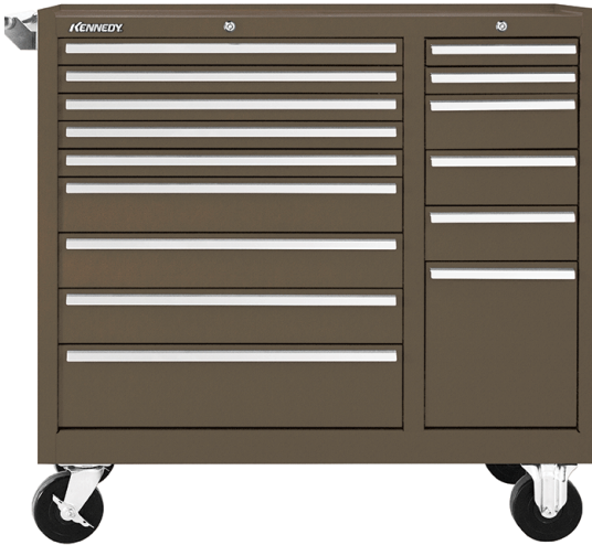
315X 15 Drawer Cabinet 40" W x 18" D x 39" H