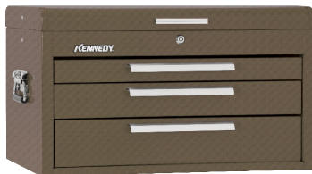
263 3 Drawer Chest