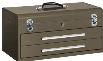
220 2 Drawer Portable Chest