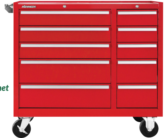
310X 10 Drawer Cabinet 40" W x 18" D x 39" H