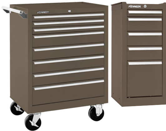
378X 8 Drawer Cabinet 27" W x 18" D x 39" H