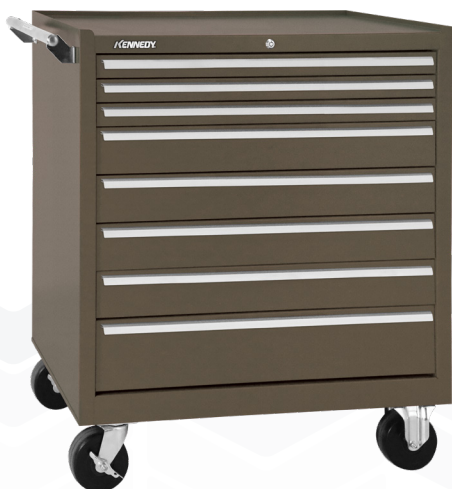
348X 8 Drawer Cabinet 34" W x 20" D x 40" H

DURABILITY COMES STANDARD SO YOU GET DEMANDING JOBS DONE TIME AND TIME AGAIN. INCREASE PRODUCTIVITY. GET THE JOB DONE.