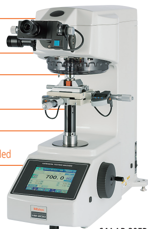
64AAB 305PA HM-210A

MeasurLink ENABLED Data Management Software by Mitutoyo