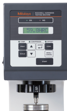
HR-320MS, HR-430MR, HR-430MS Interface