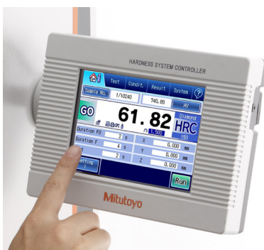
HR-530, HR-530L, HR-610A & HR-620A Touchscreen Controller